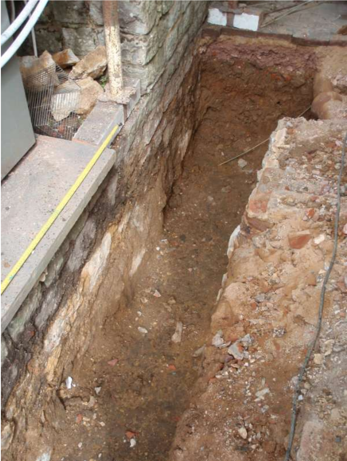
Plate 3. The site showing cutting of foundation trenches on the east side