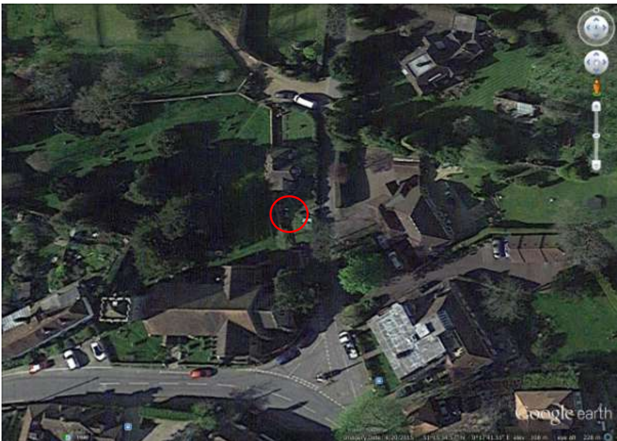
Plate 1. Aerial view of site (red circle) showing the site prior to development.