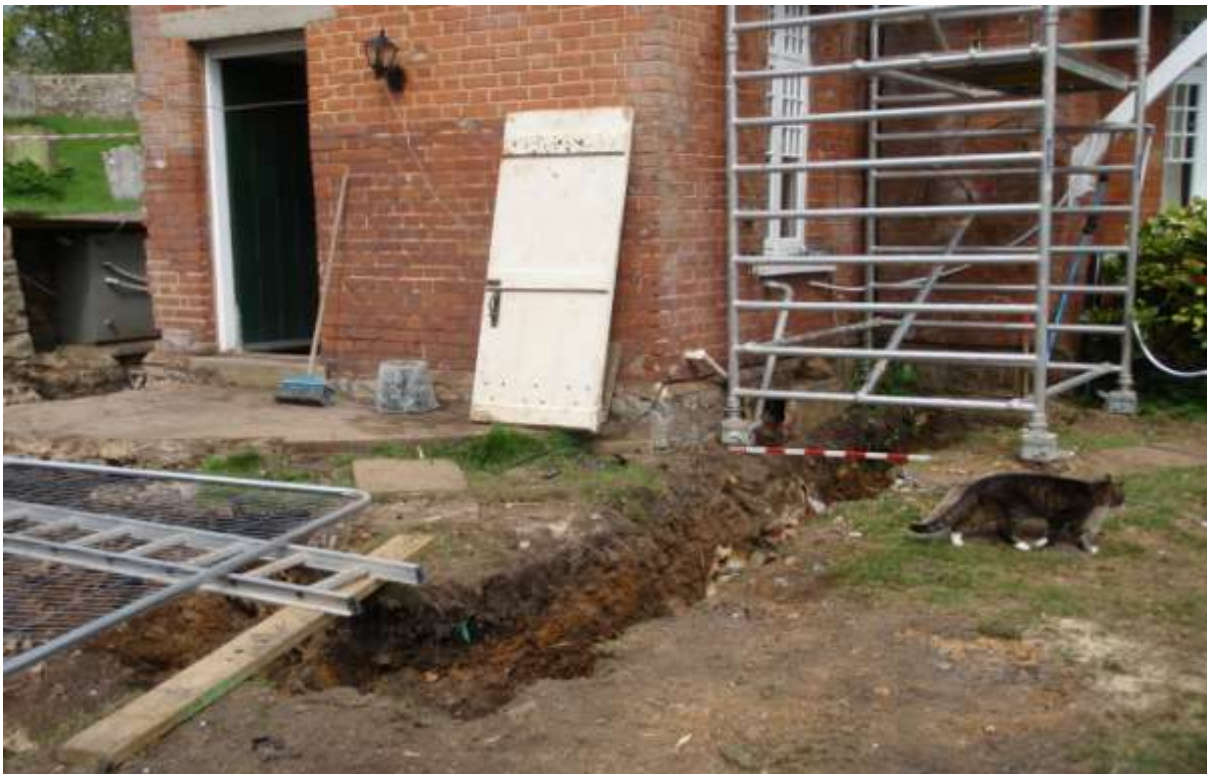
Plate 6. View of site of Ashenden Cottage (facing north west)