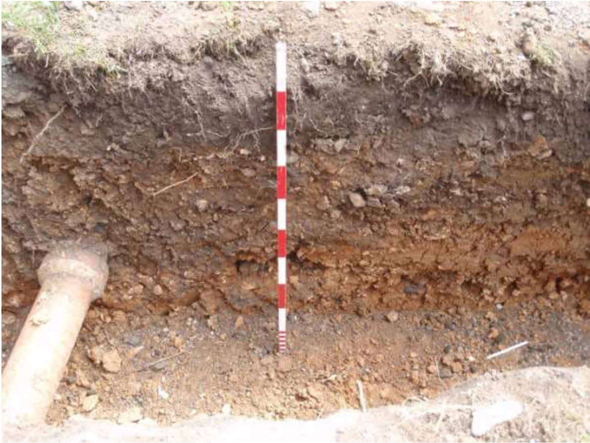
Plate 5. Section of foundation trenches (facing west)