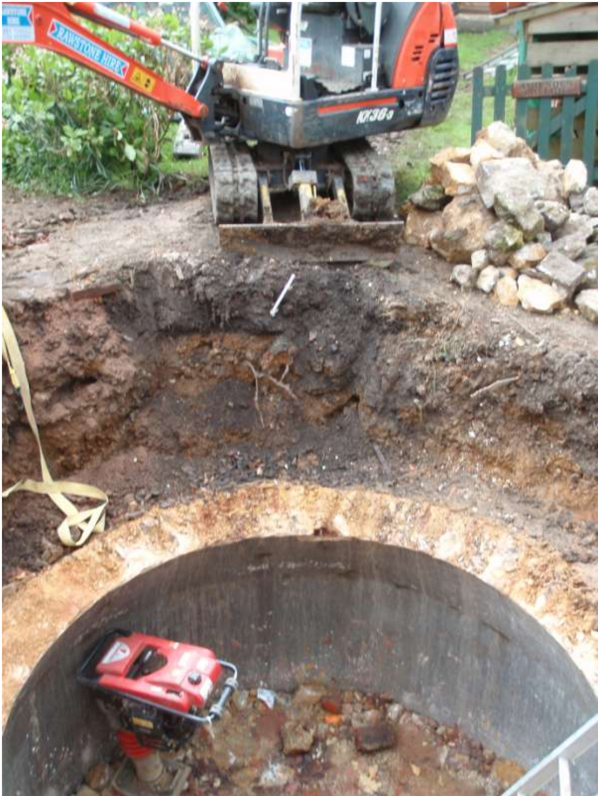
Plate 2. General view of site with Victorian cess pit