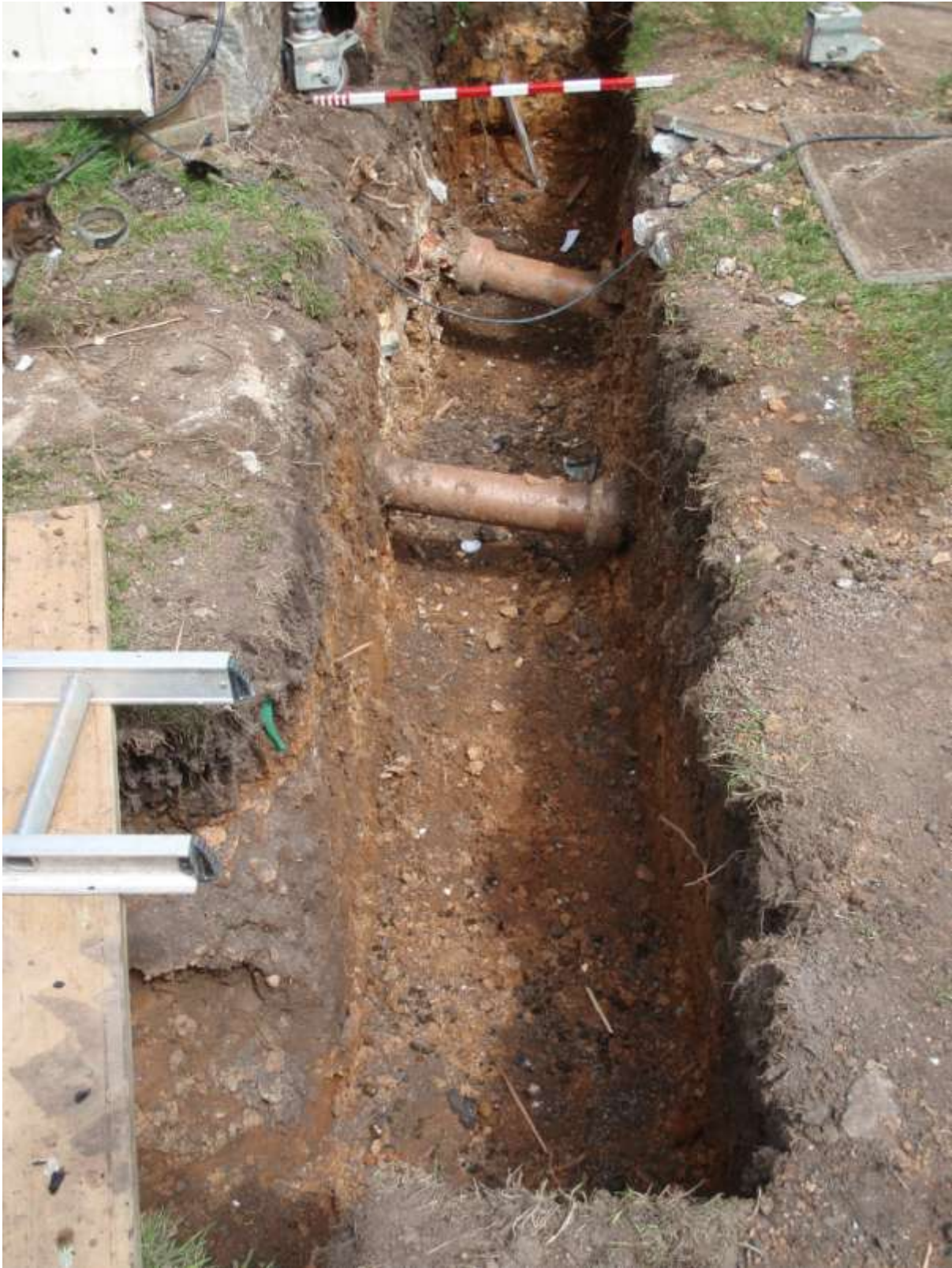
Plate 4. Foundation trenches on the east side